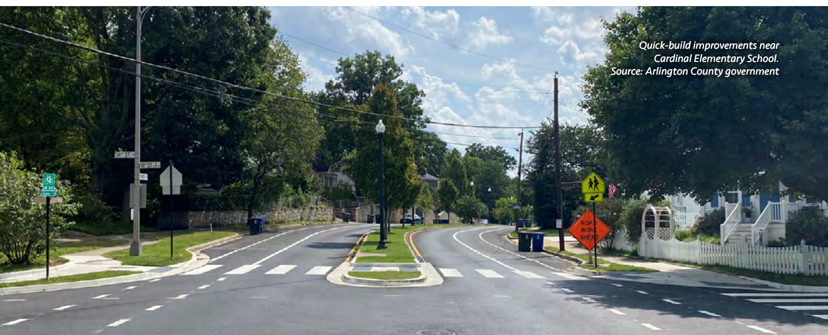
Quick-build improvements near Cardinal Elementary School.

For example, at Oakridge Elementary School a school safety pilot temporarily closed adjacent streets during arrival and dismissal times. Arlington designed the road closure in response to school staff concerns for multimodal safety with heavy school bus operations. This pilot improved safety and access for pedestrians, bicyclists, and bus riders. The County worked with school staff to send messaging, collect community feedback, and identify a permanent solution for safe pick-up and drop-off.