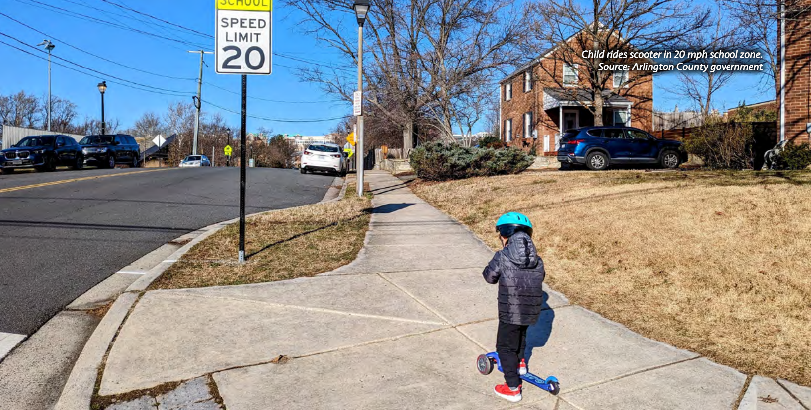
Child rides scooter in 20 mph school zone. Source: Arlington County government

The Vision Zero team also meets regularly with the Arlington Roadway Safety Club at Washington-Liberty High School and regularly engages with the County's committees, commissions, business community, and pedestrian and bike safety advocates through the Vision Zero External Stakeholders Group. They also collaborate with the Northern Virginia chapter of Families for Safe Streets.