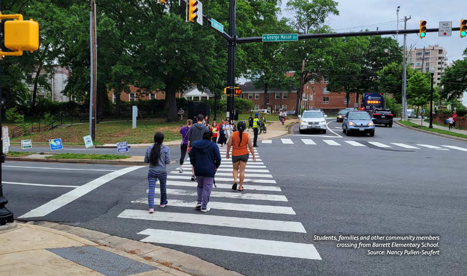
Students, families and other community members crossing from Barrett Elementary School.